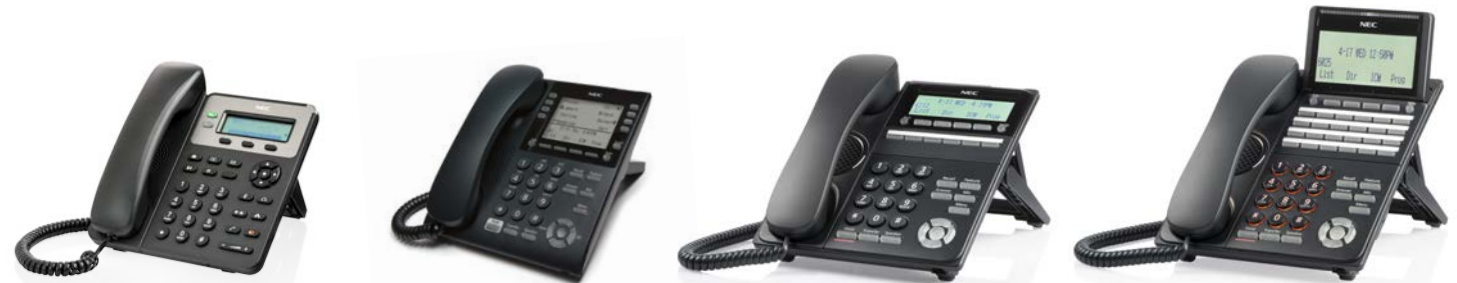
Mono: Easy call control from the office