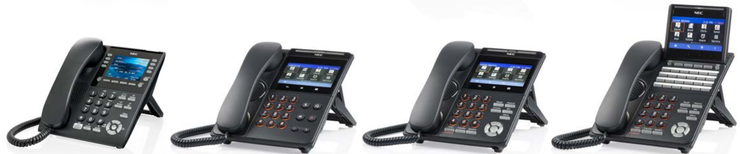
Color: Easy call control from the office, remote or home-based working, hot-desking