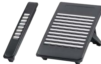
8-line Key Module / 60-line DSS Console