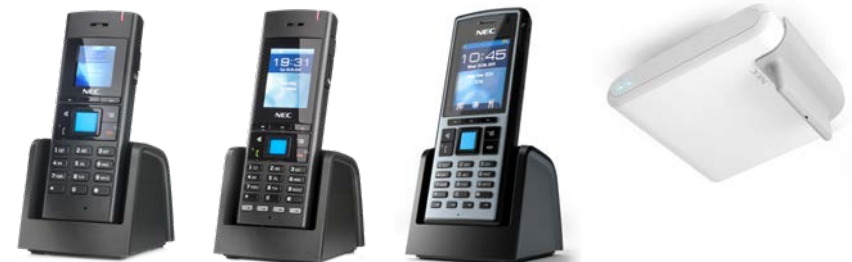
DECT handsets: for any working environment