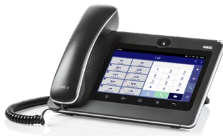
GT890: IP Desktop Video Telephone